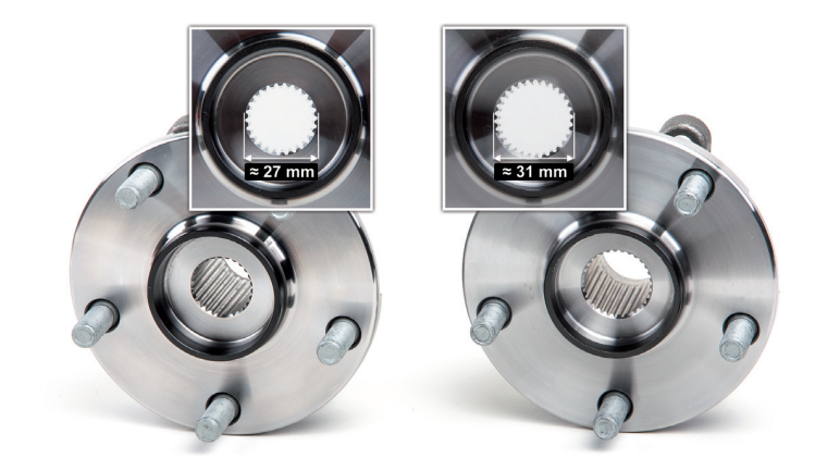
Figure 2: The diameter of the CV Joint spline is different